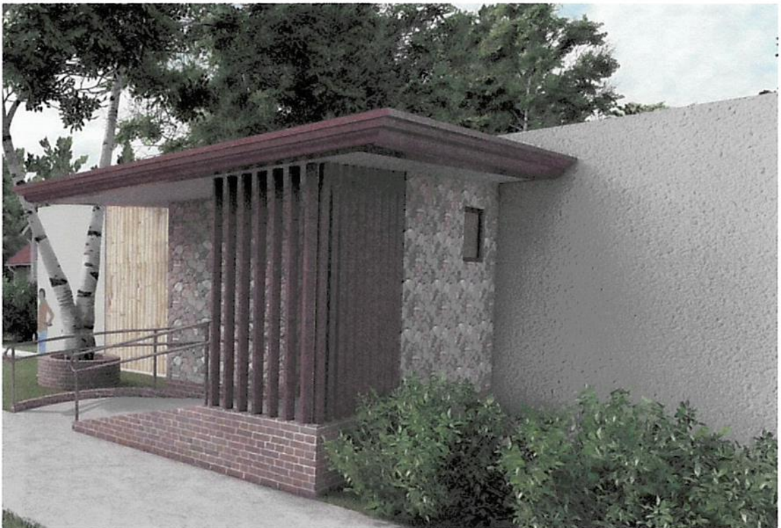
EXTERIOR PERSPECTIVE VIEW 4