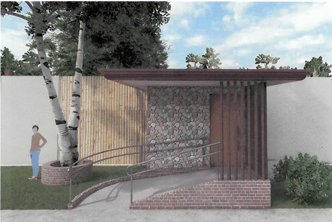
EXTERIOR PERSPECTIVE VIEW 2