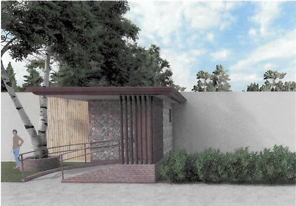
EXTERIOR PERSPECTIVE VIEW 3