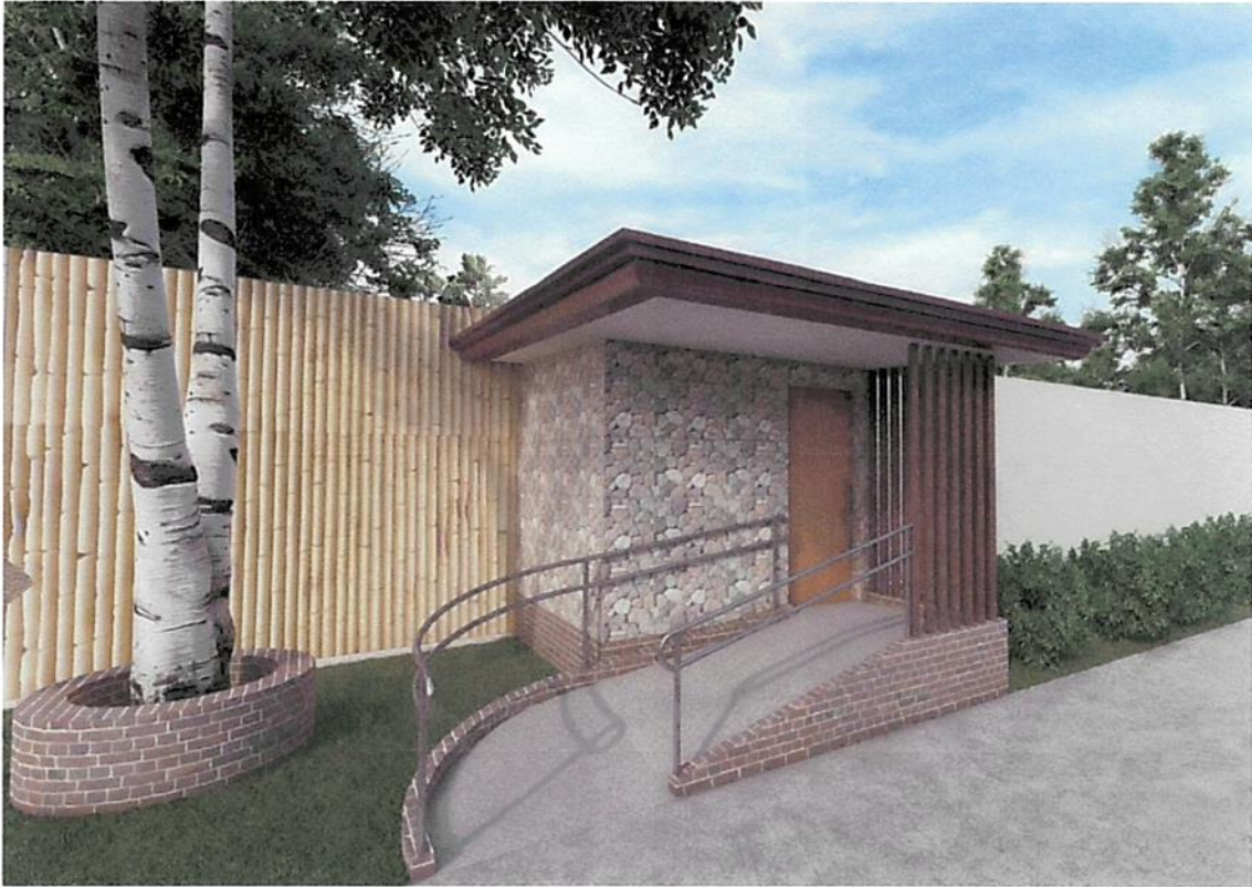
EXTERIOR PERSPECTIVE VIEW 1